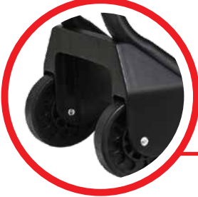
Wheels for Mobility