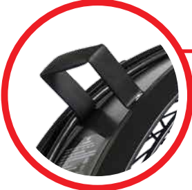
Rack Handle for east transporation