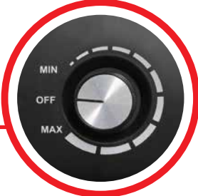
Variable Speed Control Panel