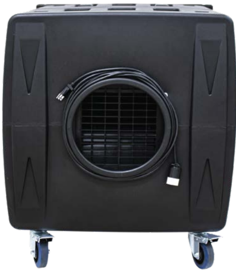
12" Exhaust Collar