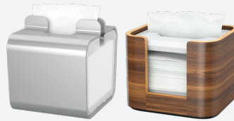
73350 / 72900 Tork Xpressnap Image

Ideal for limited service restaurants that offer napkins at the table and available in a range of contemporary colors.