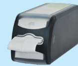
7432000 Tork Xpressnap Fit Countertop

High, medium or low capacity dispenser that fits in most pre-existing counter-top cutouts.