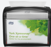
6232100 Tork Xpressnap Tabletop

Ideal for limited service restaurants that offer napkins at the table and available in a range of contemporary colors.