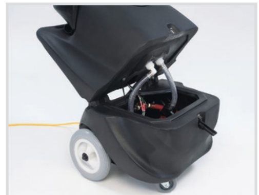
Clamshell design for easy servicing.