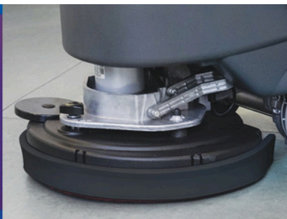
Optional splash guard keeps water in the path of the squeegee even at the fastest operation speeds.