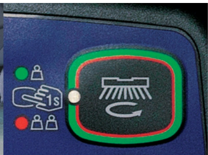
Raise, lower or even double the brush pressure right from the dashboard for even more cleaning power.