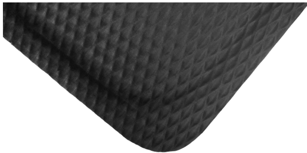
Hog Heaven with black border

Can be customized with your logo, design, or message (see Hog Heaven Impressions)