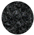
Black (66) 3', 4', 5', 6'