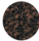
Brown/Black (48) 3', 4', 5'