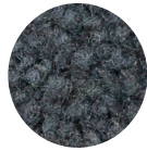
Oxford Grey (63) 3', 4'