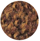
Golden Brown (64) 3', 4', 5', 6'