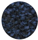
Blue/Black (71) 3', 4', 5'