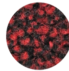
Cheyenne Red (16) 3', 4'