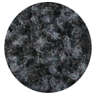
Midnight Grey (67) 3', 4', 5', 6'