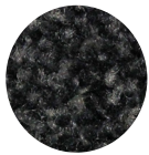
Black Mink (47) 3', 4', 5'