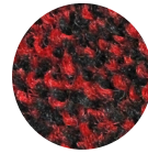
Red Pepper (76) 3', 4', 6'